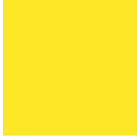
Yellow - YEL